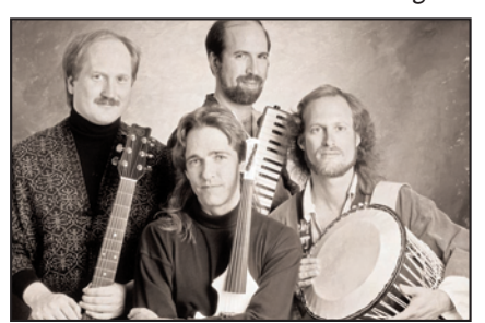
Ancient Future Circa 1990